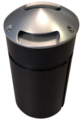
Shown with optional sleeve